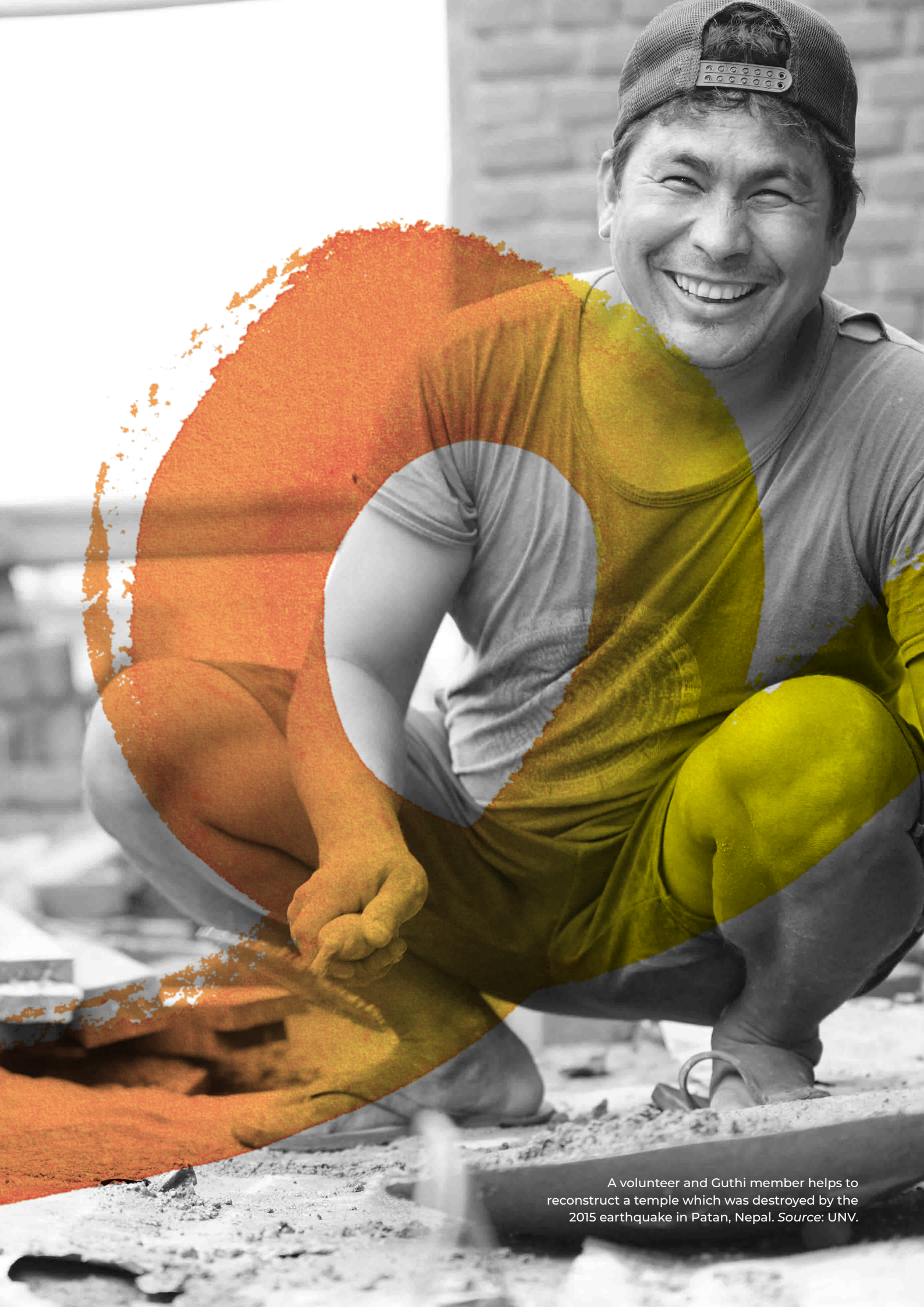
A volunteer and Guthi member helps to reconstruct a temple which was destroyed by the 2015 earthquake in Patan, Nepal.