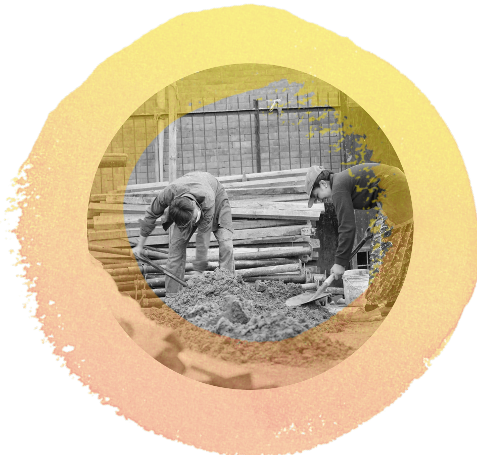
A volunteer works on a construction project in Nepal.

In Kyrgyzstan, Alga partnered with several local and regional government bodies, including the Supervisory Council of the Chui region. 114 In 2015, Alga launched the Follow Your Voice campaign which sought to increase women's participation in electoral processes and represented their interests in state bodies. 115 While Alga represents Kyrgyz women members, it also drew on opinions gathered through their educational campaigns. They were then able to share the insights gained from these campaigns with local councils. These insights proved useful when local governments had to make difficult decisions on complex issues surrounding women's political and civic participation, domestic violence, and women's rights.