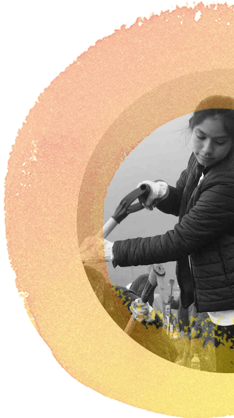
A volunteer maintains paths to promote ecotourism in Peru.

Two forms of volunteerism are evident in the case studies. In Nepal and Kyrgyzstan, volunteer efforts were aimed at helping communities respond to emerging issues through discussions and collective decision-making—often called mutual aid 105 —while in Ecuador, Tunisia and DRC, volunteers engaged in meetings and public dialogues.