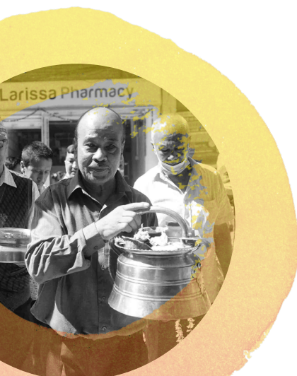
A volunteer and member of the Guthi institution takes part in a religious procession. Nepal’s volunteer-based Guthi institution supports and partners with the Government to preserve cultural heritage.

People’s participation in deliberative governance has led to more responsive and sustainable outcomes that help address the needs of the most marginalized. Volunteerism has proved to be a pathway to strengthen collaboration between people and states. But such relationships are constantly changing due to differing agendas, priorities and needs, both of volunteers and state institutions.