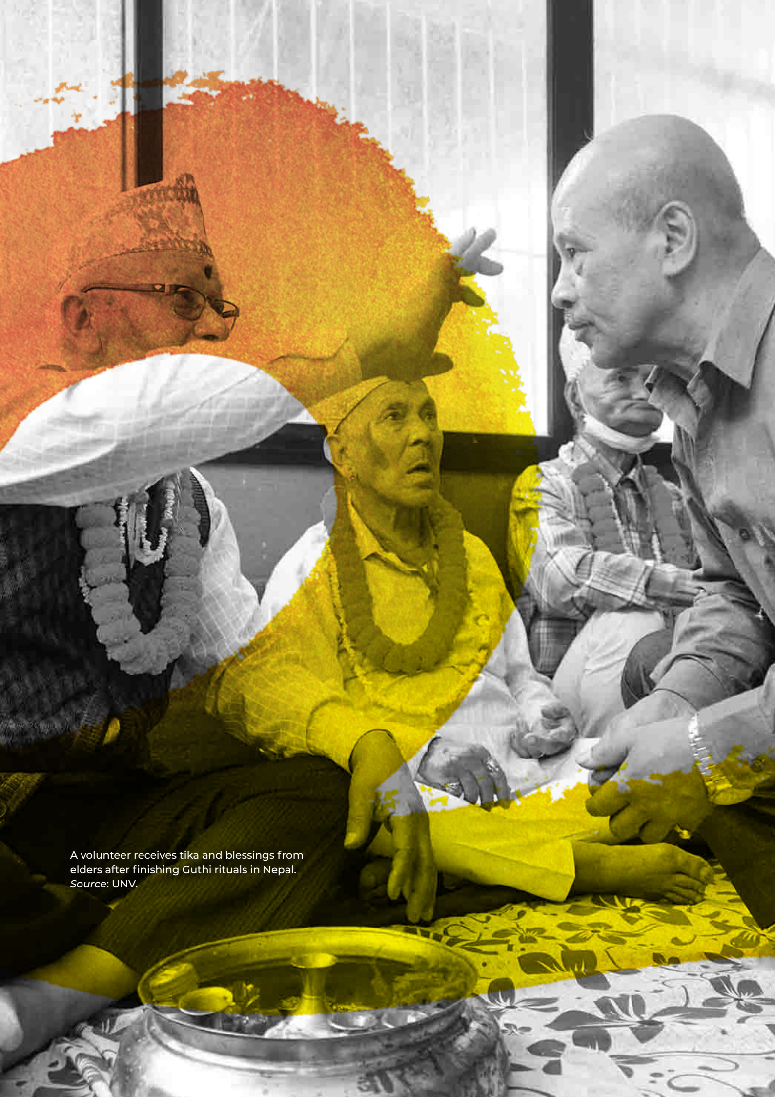
A volunteer receives tika and blessings from elders after finishing Guthi rituals in Nepal.