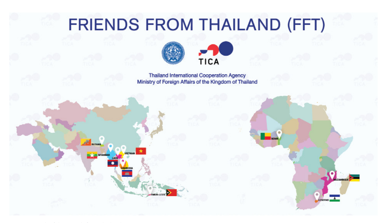
Figure 1: Reach of the Friends from Thailand Programme.