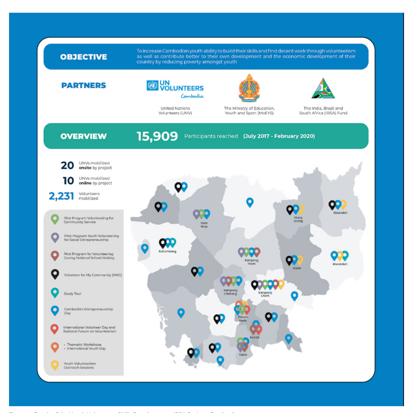
Figure 1: Reach of the Youth Volunteers Skills Development, IBSA Project, Cambodia.

Thus, a South-South cooperation development fund provided the capital that supported the robust development of a national volunteer policy and a youth volunteering scheme in Cambodia. Furthermore, triangular cooperation through which UNV facilitated a South-South exchange between youth volunteers in Cambodia and India as part of this project led to knowledge exchange on volunteer infrastructure between Cambodia and India.