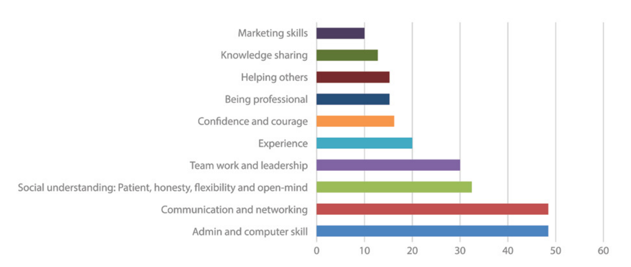
Figure 2: Skills youth reported they gained during their volunteer assignments and that they now apply in their jobs.

The project also increased awareness of and support for volunteerism in Cambodia. Recruiting volunteers and finding placements for volunteers became progressively easier as concrete benefits from the project for the volunteers and the communities and organizations in which they worked became apparent.<sup>40</sup>